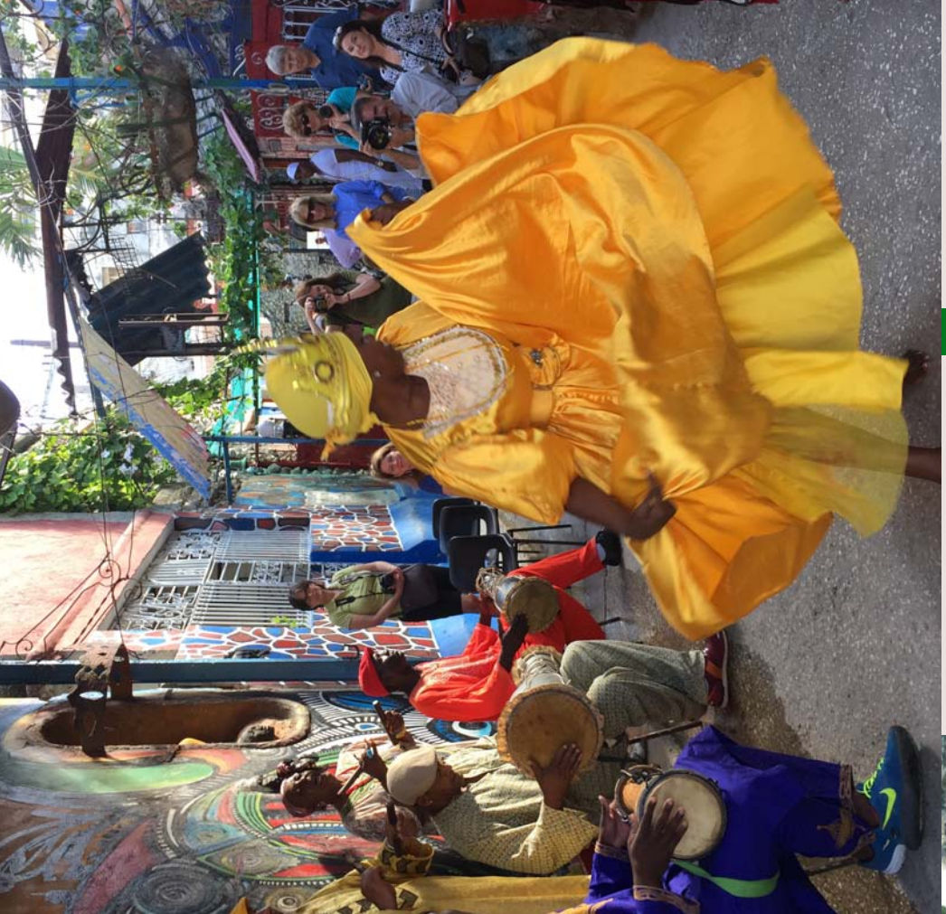
Classic Escapes protects our planet.

CLASSIC ESCAPES 58-25 QUEENS BOULEVARD WOODSIDE, NY 11377