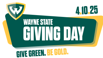
Primary Logo (White/Light Backgrounds)