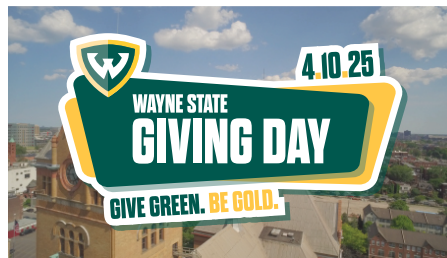
Reverse Logo (Color/Busy backgrounds)

Font Family: Dharma Gothic (Adobe Fonts)